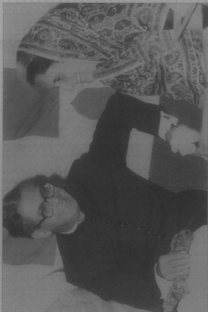
With Prime Minister Indira Gandhi, New Delhi, 1981.