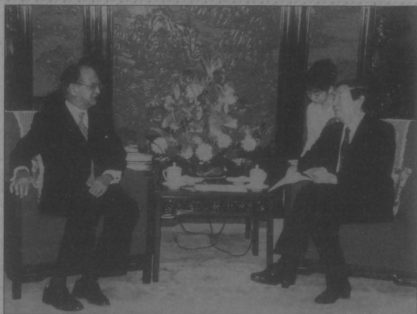
With Prime Minister Zhu Rongji, People's Republic of China, Beijing, 2001.