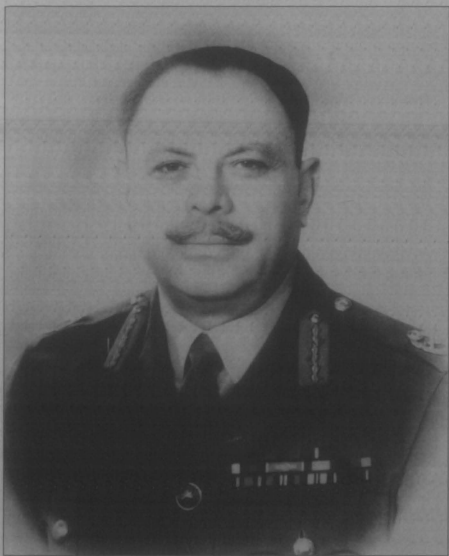
M. Ayub Khan (President of Pakistan, 1960-69).