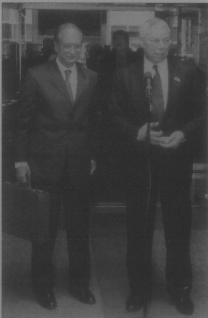
With US Secretary of State Colin Powell, Washington D.C., 2001.