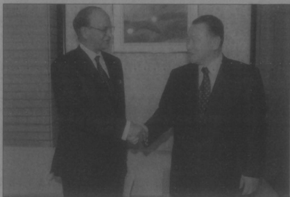
With the Prime Minister of Japan, Yoshiro Mori, Tokyo, 2001.