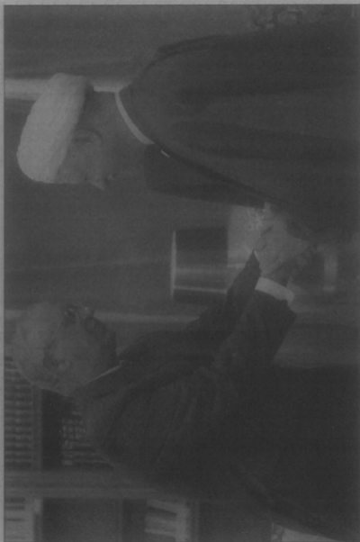
With the Head of Expediency Council (former President) Hashemi Rafsanjani, Islamic Republic of Iran, Tehran, 2005.