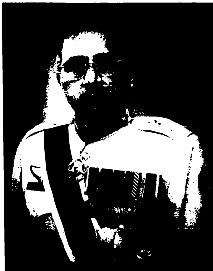
Pervez Musharraf (President of Pakistan, 2001–2008)