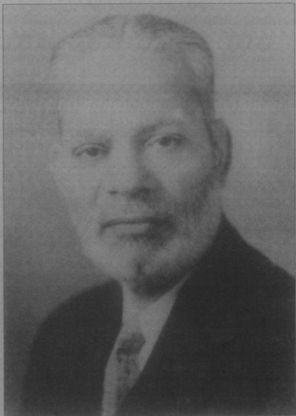
Choudhary Sir Zafrullah Khan (first Foreign Minister of Pakistan).