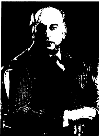
A. Bhutto (Prime Minister of Pakistan, 1973-1977).