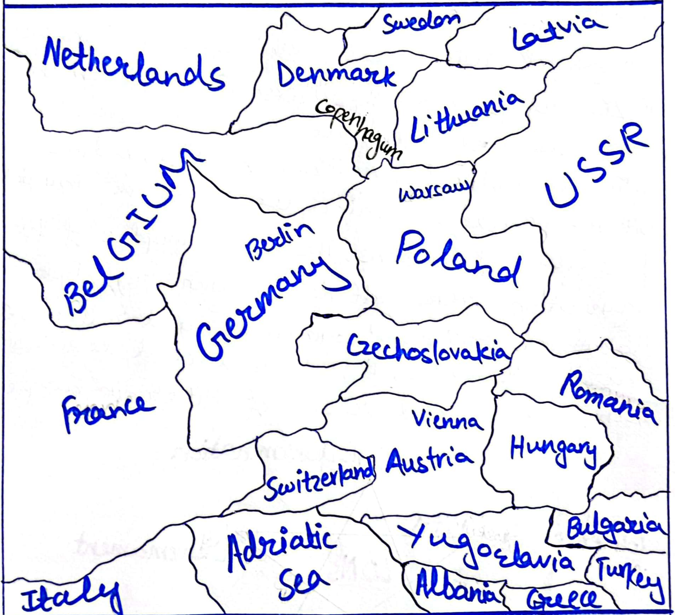
Figure : Post World War 1 Order

The world war 1 ended up by casting dark shadows of horrors on most of the world. Treaty of Versailles was signed in 1919 for setting post world war 1 order and it established the LONs for preserving this order and preventing future conflicts.