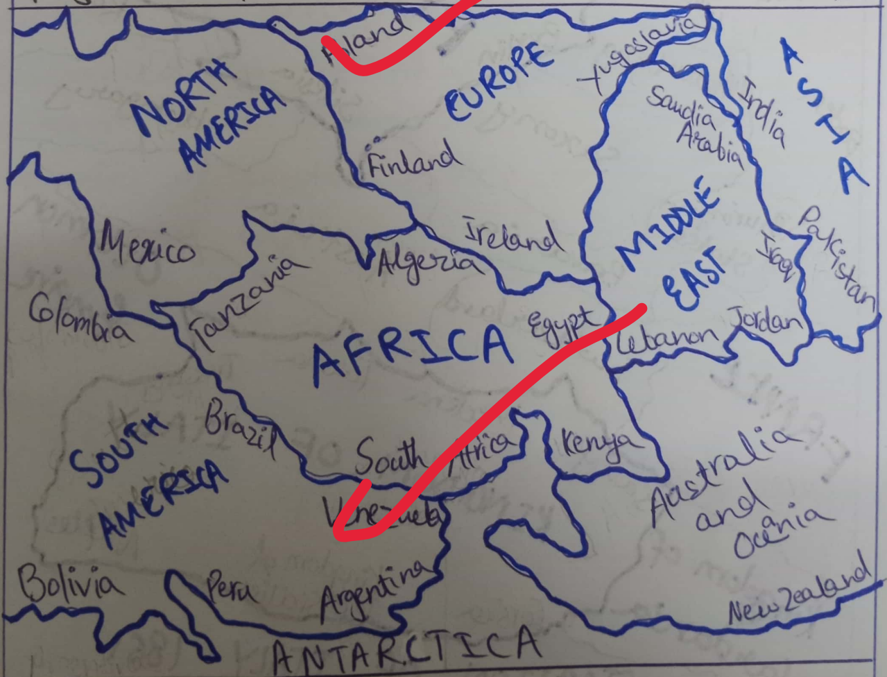
Figure: Formation Of Nation States In 19 th , 20 th Century

The colonialism and imperialism initiated the independence movements in Asia, North Africa and various colonized territories in 19 th and 20 th century. This led toward creation of various nation states.