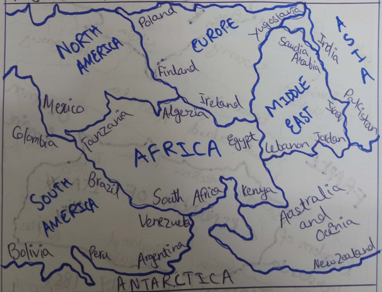
Figure : Formation Of Nation States In 19 th , 20 th Century

The colonialism and imperialism initiated the independence movements in Asia, North Africa and various colonized territories in 19 th and 20 th century. This led toward creation of various nation states.