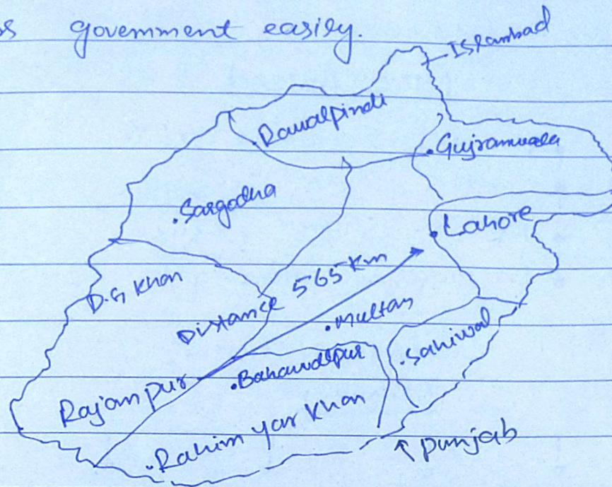
Fig: Map depicts distance of remote city from provincial capital of Punjab

The creation of new provinces will facilitate people regarding accessing supreme provincial high court easily and other provincial departments in the same manner.