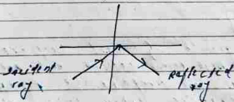
Total internal reflection

Light of incident rays strikes on the surface and without further going on the next region bounces back and prevents escape of incident light.