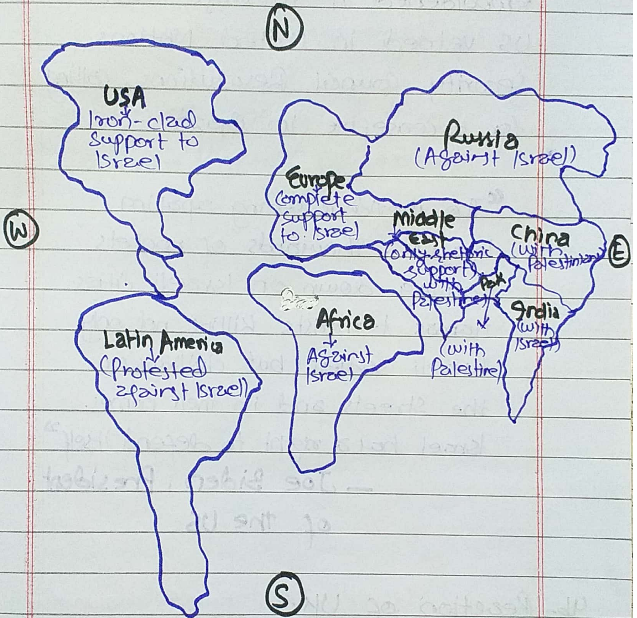
Map showing Global Powers Support to Either Palestine Or Israel